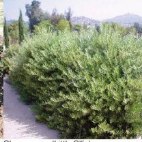
Olea europea 'Little Ollie'