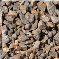
Copper Canyon Crushed Stone