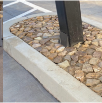
1"-4" crushed gravel mortared in colored cement