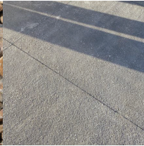
Natural colored concrete with 3/8" sawcut joint