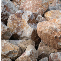
Apache Sunset Boulders