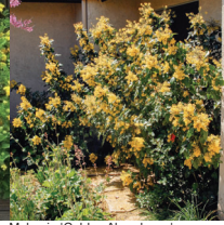
Mahonia 'Golden Abundance'