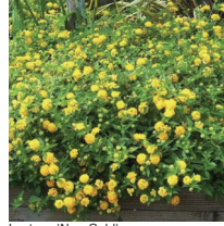
Lantana 'New Gold'