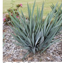
Dianella 'Clarity Blue'