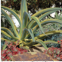
Agave vilmoriniana 'Stained Glass'