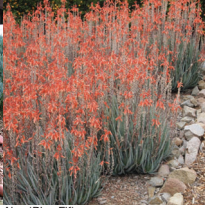
Aloe 'Blue Elf'