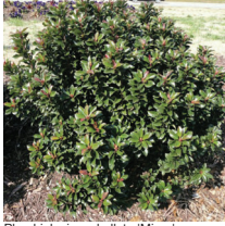
Rhapiolepis umbellata 'Minor'