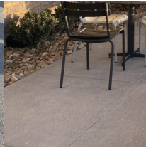
Smockstack 102 integral colored concrete with 3/8" sawcut joint