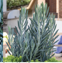
Senecio 'Mount Everest'