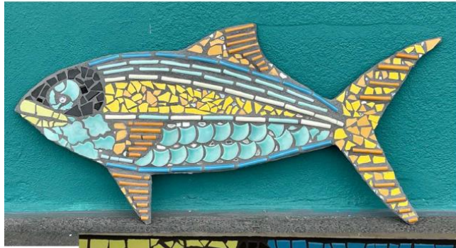
Mosaic Art Examples